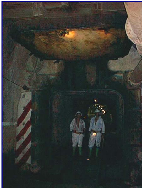
Figure 4 : High Pressure Door

Each of the operational levels are equipped with high pressure water doors which form an integral part of the emergency evacuation procedure (see figure 4). In terms of this procedure, underground workers have 27 minutes to get to safety in the event of flooding caused by a complete pump breakdown or failure.