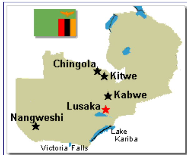
Figure 1 : Map of Zambia

The mine produces copper from an orebody with an average grade of 5% at a rate of 220 000 tons of copper per year.