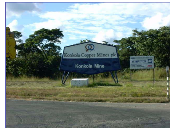
Figure 2 : Konkola Mine

An average of 300 000 m 3 of water per day is pumped from the mine which gives an average ratio of \pm 58:1 of water to ore. This may be compared to the similar ratio of water pumped to ore hoisted at the other Zambian copperbelt mines of 4:1. Clearly this constitutes a critical commercial as well as logistical problem in the overall running of the mine.