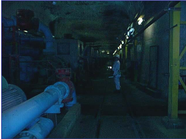
Figure 3 : Pump Chamber – 985 level

Each of the operational levels are equipped with high pressure water doors which form an integral part of the emergency evacuation procedure (see figure 4). In terms of this procedure, underground workers have 27 minutes to get to safety in the event of flooding caused by a complete pump breakdown or failure.