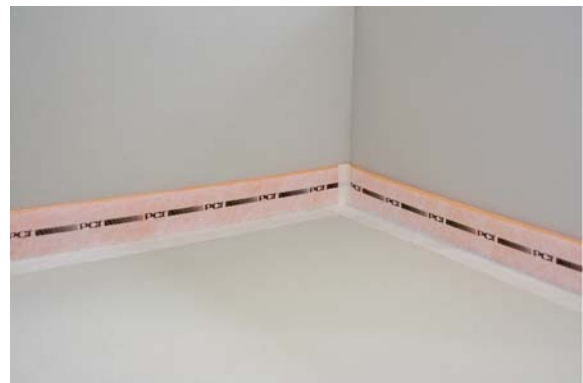
PCI Pectape Silent can be rapidly and securely applied